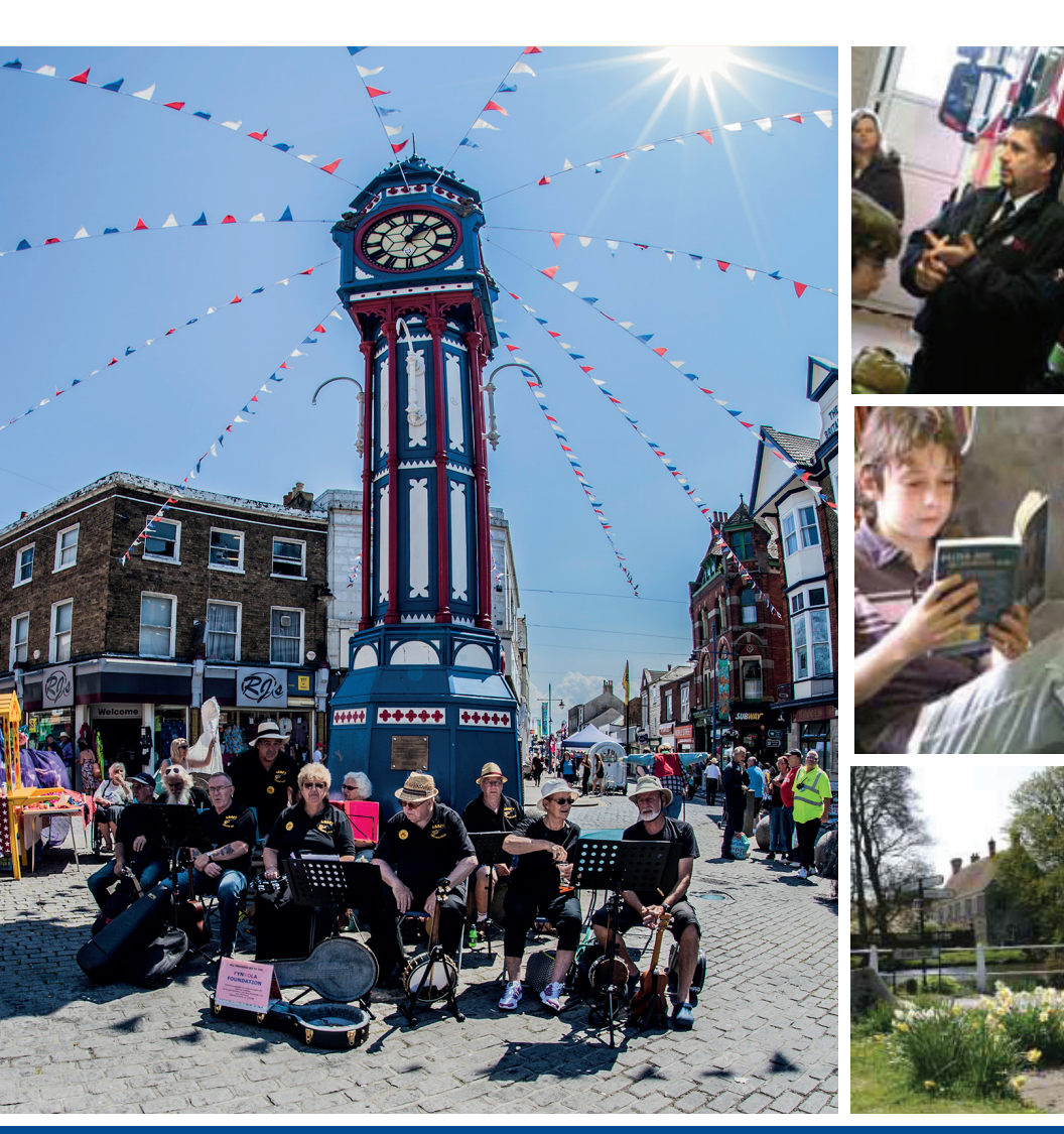
How to pay • Help and advice • Benefits information • Get in touch and much more from Kent County Council, Swale Borough Council, Kent Police & Crime Commissioner and Kent and Medway Fire and Rescue Authority